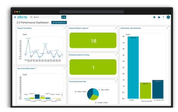
Graphic & configurable admin interface

© Copyright 2022 Efecte Plc. All rights reserved. All information presented in this document is subject to change without notice and does not represent commitment on Efecte Plc.